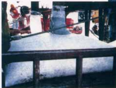
Feeding of Solidifier Mixed Slurry